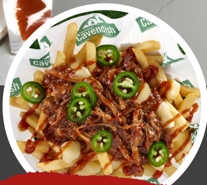
PFG # 416232 Luigi Regular Cut