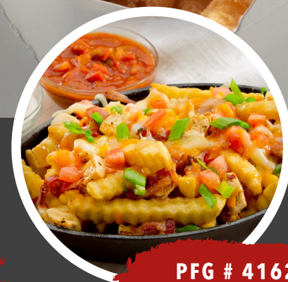
PFG # 416234 Luigi Crinkle Cut