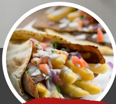
PFG # 416248 Luigi Steak Cut