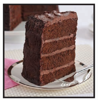
*made by Dianne's Fine Desserts