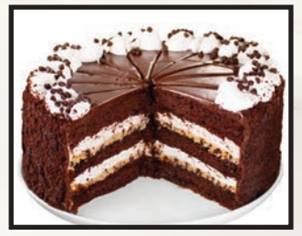
*made by David's Cookies