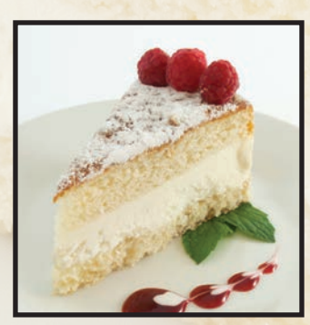
*made by Dianne's Fine Desserts