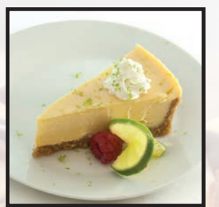
*made by Mike's Pies

Southern style pecan pie with shortbread crust and infused with Kentucky Bourbon.