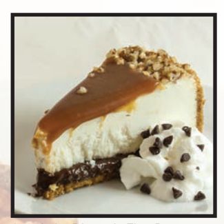
*made by Dianne's Fine Desserts