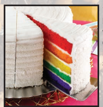
*made by David's Cookies