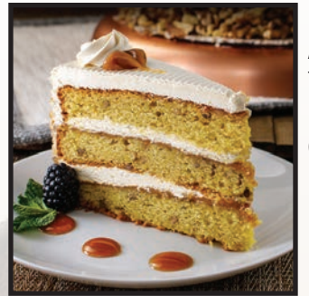
*made by David's Cookies