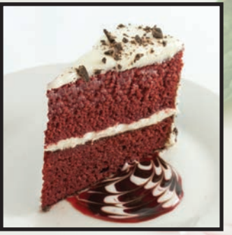
*made by Dianne's Fine Desserts