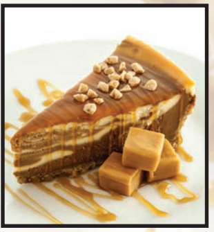
*made by Mike's Pies