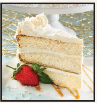
*made by David's Cookies