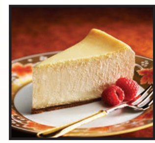
*made by Cannoli Factory