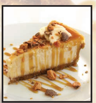
*made by Mike's Pies