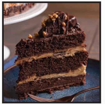
*made by David's Cookies