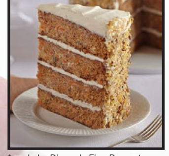
*made by Dianne's Fine Desserts

Moist chocolate cake topped with chocolate frosting, and stacked irresistibly high.