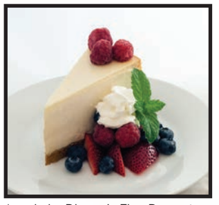
*made by Dianne's Fine Desserts