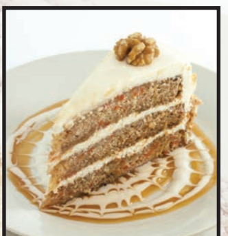
*made by Dianne's Fine Desserts