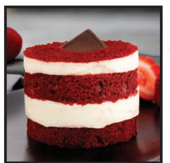
*made by David's Cookies