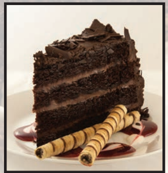
*made by David's Cookies