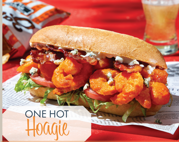
ONE HOT Hoagie